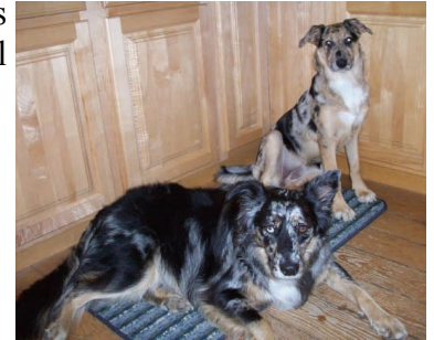
Mickiak & Shawnee now.

To read more about successful adoptions, click the Happy Endings link at www.ns4ar.org