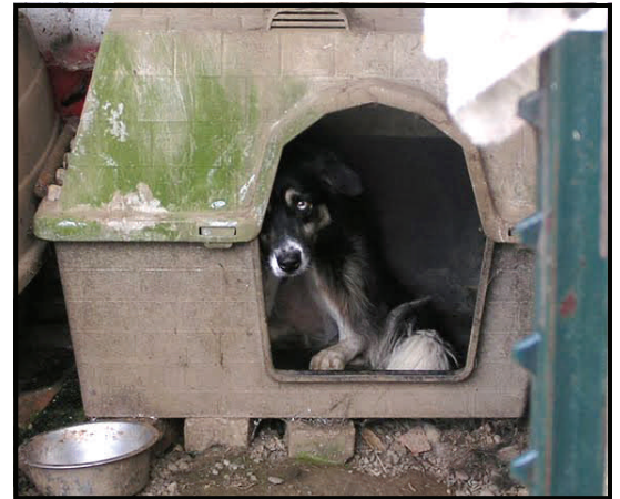
Juneau at a shelter before being rescued by a New Spirit volunteer.